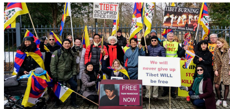
SFT Denmark members joined March 10, Tibetan National Uprising Day in Copenhagen.