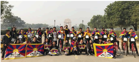
SFT Delhi organized a bike rally to commemorate Tibetan Independence Day.

Grassroots organizing is at the heart of what SFT does, made possible by the amazing work of our members and supporters around the world. Check out some of the actions, trainings, and protests they've coordinated in 2018.