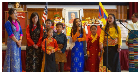
SFT University of Massachusetts Amherst organized a Losar (Tibetan New Year) celebration event.