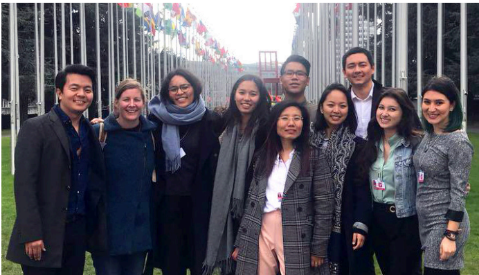
UN Tibet Advocacy Coalition training for youth participants from across Europe.

As part of the Tibet Advocacy Coalition, SFT has engaged in United Nations (UN) advocacy work for the past five years. The Coalition urges diplomats from around the world to raise Tibet to build pressure on Beijing to address its failed policies and back down from its vicious campaign of violence against Tibetans. Throughout the year, SFT visited Geneva for the UN Human Rights Council, organized trainings for youth on UN engagement, and took part in various events, including the “Indigenous Participation” side event held at the UN Headquarters in New York by the Canadian Mission.