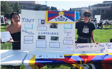
SFT University of Toronto St. George tabling to recruit new members.