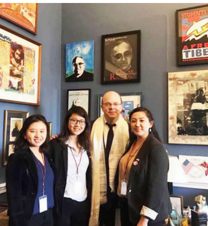
SFT members at US Congressman Jim McGovern’s office during lobby day.

As a result of years of campaigning and hard work, a major milestone was achieved when the United States House of Representatives approved the Reciprocal Access to Tibet Act on September 24, 2018. This is a historic piece of legislation, originally sponsored by Congressman Jim McGovern. Under this bill, Chinese authorities who are involved in the design and implementation of policies that restrict travel to Tibetan areas would become ineligible to receive a visa or be admitted to the United States. On the day the House passed the bill, Congressman McGovern said, “America’s foreign policy ought to send the message that we value human rights. That we stand with those working for freedom. That those values compel us to speak out when we see something that’s wrong. And that we will hold accountable those who violate the basic human rights we are all entitled to. And that’s exactly what this bill today is all about.”