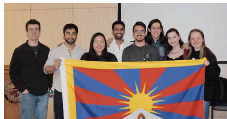
SFT University of Wisconsin La Crosse organized a talk and training on "How to Build a Nonviolent Movement" during their school's Social Justice Week.