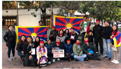
SFT West organized a silent sit-in and prostration in Downtown Berkeley, collecting petition signatures for the Panchen Lama's release.