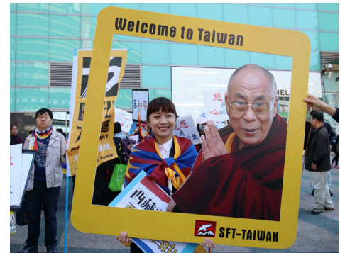
SFT Taiwan members joined March 10, Tibetan National Uprising Day in Taipei city.