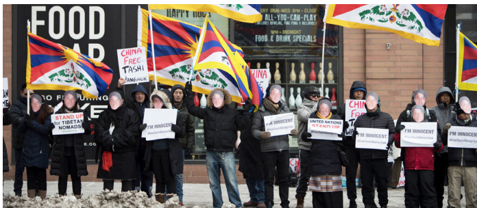
Protest at the Chinese consulate in New York.