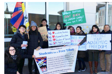
Tibetans and supporters protesting UMass Boston’s potential renewal of their Confucius Institute contract.

In the United States, the John McCain 2019 National Defense Authorization Act was signed into law on August 13, 2018, which bars any U.S. university from using Pentagon resources for any program involving CIs. In 2018, at least five schools have ended or committed to not renewing their contract with CI, the