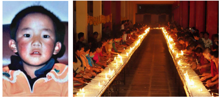
SFT India and Tashi Lhunpo Monastery, the exile seat of the Panchen Lama, collaborated to set a world record for “The Most Number of Candles Lit on a Birthday Cake.”

This year, on the 29 th birthday of Gendun Choekyi Nyima (11 th Panchen Lama), SFT India, in collaboration with Tashi Lhunpo Monastery, the exile seat of the Panchen Lama, carried out a successful campaign to highlight the Panchen Lama’s case in a new and creative way. The duo set a new world record for “The Most Candles Lit on a Birthday Cake” by lighting 130,000 candles, representing the approximate number of Tibetans in exile and their wishes for the safe release of the Panchen Lama. The lighting of the candles was held at Tashi Lhunpo Monastery in South India. During the event in South India, over 500 people joined, including Tibetan Government-in-Exile representatives, community heads, NGO leaders, students, and monks and nuns. SFT chapters and networks around the world also organized various other events to observe the day.