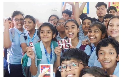
SFT India's 2018 grassroots speaking tour reached 500+ students for Tibet.