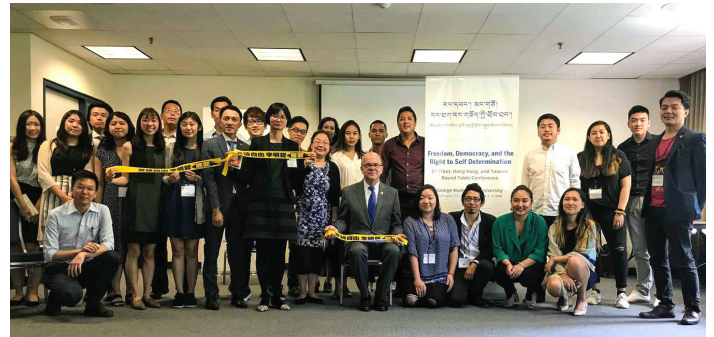
Participants and organizers of the conference with US Congressman Jim McGovern.

In June, SFT organized the 2 nd "Tibet, Hong Kong, Taiwan Round Table Conference for Freedom, Democracy, and the Right to Self-Determination" in Washington, DC at George Washington University to discuss common issues, build understanding, and develop a strategic long-term vision. The event brought together 35 young front-line movement leaders, organizers, and strategists, representing 12 leading organizations and networks from all three movements. The participants joined SFT from Canada, Hong Kong, Switzerland, Taiwan, the United Kingdom, and across the United States. The conference also invited United States Congressman Jim McGovern, National Endowment for Democracy President Carl Gershman, leading Chinese human rights lawyer Teng Biao, Human Rights Watch China Director Sophie Richardson, and International Center for Non-violent Conflict Executive Director Hardy Merriman to discuss a global strategy for defending freedom and democracy against the growing international threat posed by China and its totalitarian regime. Also discussed at the conference was building new ways to support the movement at the global level.