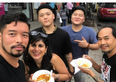
Momo enthusiasts at the Momo Crawl in New York City.

In 2018, SFT hosted more than 2,000 people at Momo Crawls in Toronto, Canada and New York, USA. Both of