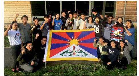
SFT UK members organized the three-day UK National Conference at Pestalozzi International Village Trust to engage and inspire young Tibetans and supporters.