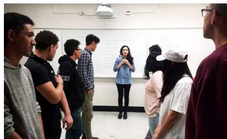
SFT grassroots training at Hunter College in New York.