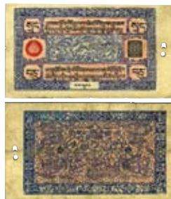
Tibetan currency notes