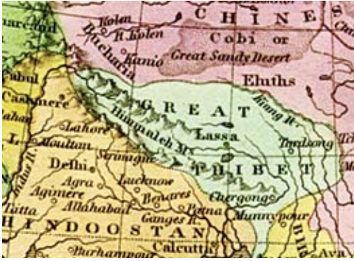
Detail from 1827 map of Asia.

spelled as Tobbat, Thibbet, or the Kingdom of Barantola) as separate from China or Cathay. A map of Asia drawn by the Dutch cartographer, Pietar van der Aa around 1680