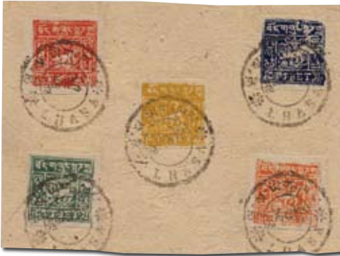
Tibetan postage stamps and cover.