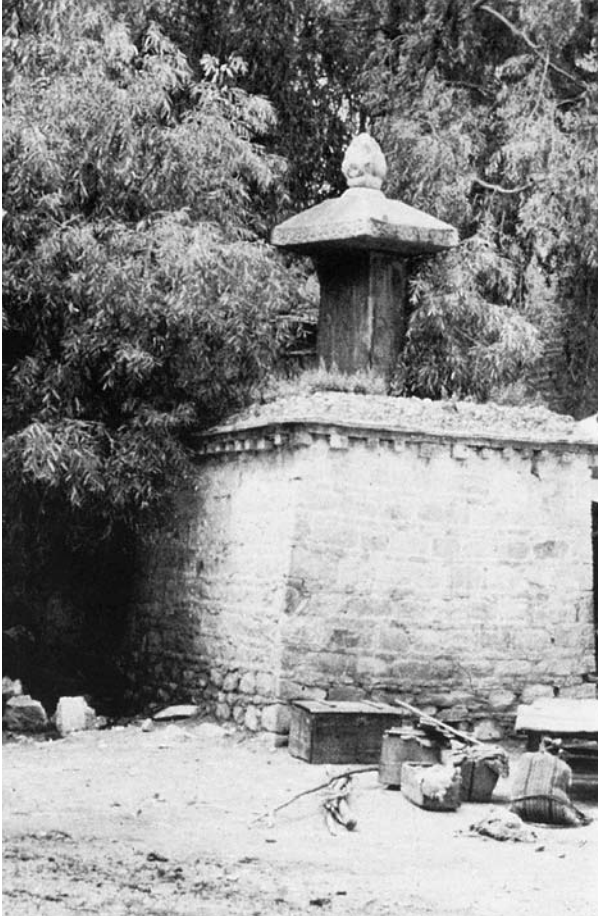
Tibetan - China Treaty Pillar (821 AD) within protective enclosure.

One of the most important treaties between the Tibetan Empire and the Chinese Empire dates back to AD 821-822. The text, carved in Tibetan and Chinese on a stone pillar 36 near the Jokhang temple in Lhasa states that “Great Tibet” and “Great